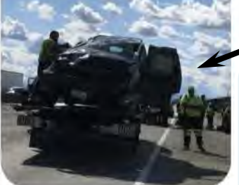
40w Like Reply